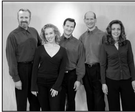
Five By Design

The members of Five By Design are also dedicated music educators. Prior to their Sept. 8-9 appearance, the vocalists will be in the classroom, conducting workshops with Shakopee fine arts students. Exposing students to quality music and performances is part of the group's educational mis-